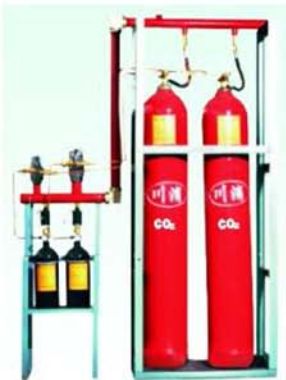
High-pressure carbon dioxide automatic extinguishing system

Low-pressure carbon dioxide extinguishing system