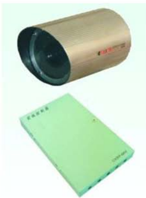
Spare Parts for digital picture controlled monitor system