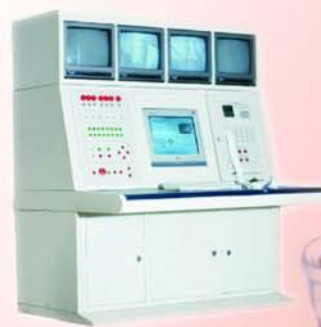
Control panel for digital picture controlled monitor system