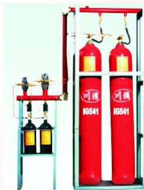
(IG-541) Blending gas extinguishing system