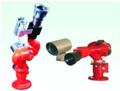
Digital picture controlled monitor