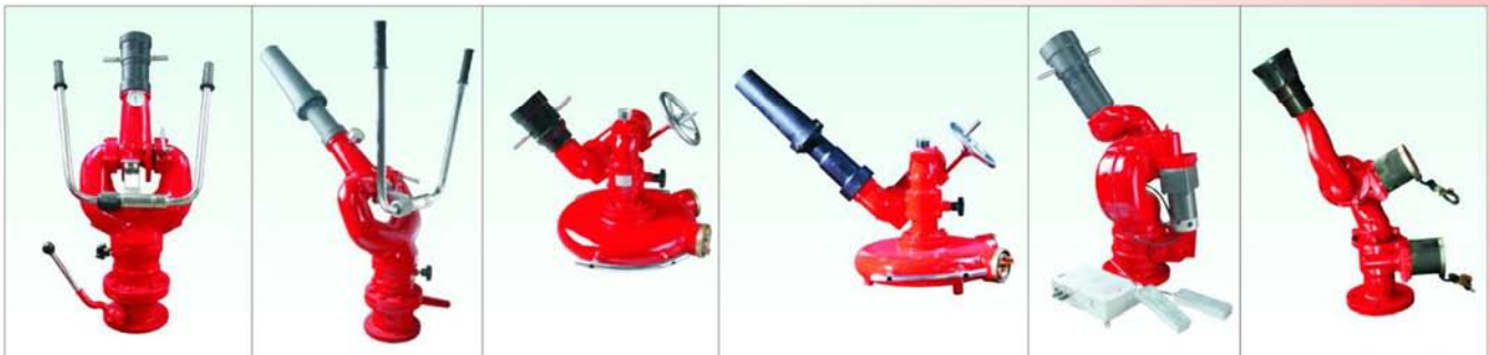
PS water monitor