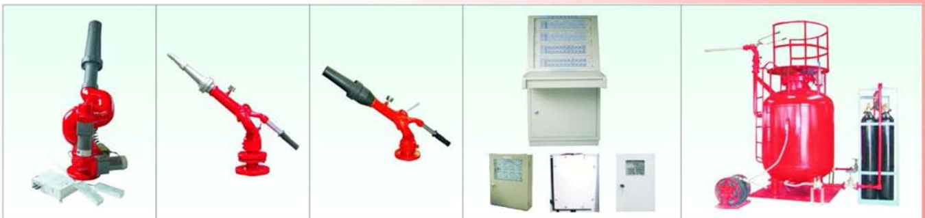
PPKD electric controlled foam monitor