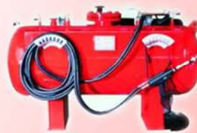
Water fog extinguishing system