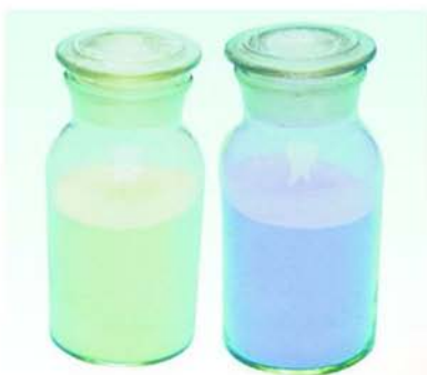
ABC dry powder extinguishing agent