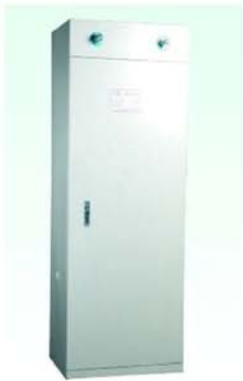
Ark-type extinguishing device of FM200