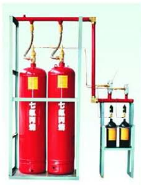
FM200 automatic extinguishing system