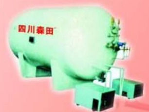
Low-pressure carbon dioxide extinguishing system